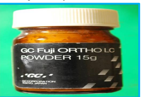
Fig. 3b: RMGIC-powder