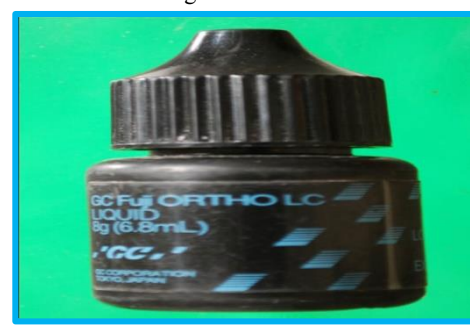
Fig. 3c: RMGIC-liquid