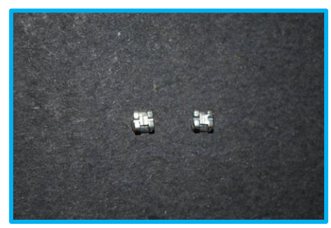
Fig. 2: Metal premolar brackets

Shetty S, Hegde S, Kalavani, Ashith MV, Siddharth R