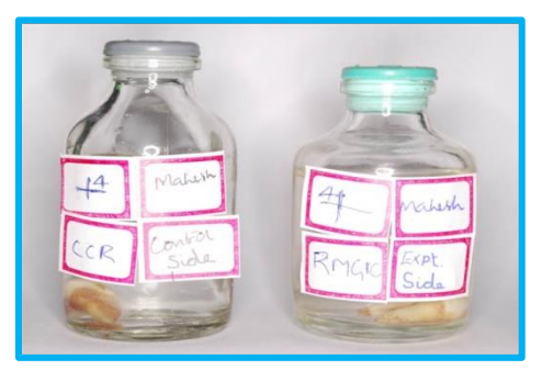
Fig. 7: Glass specimen