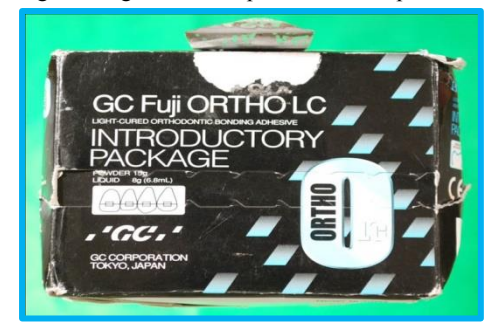
Fig. 3a: RMGIC