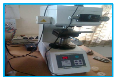
Fig. 9: Micro hardness tester