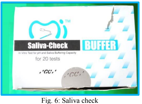
ect bonding agent. Thr

an alternative direct bonding agent. Three reaction occur and are required for the complete setting of this adhesive: 1) traditional glass ionomer acid-base reaction; 2) light activated radical polymerization of HEMA and two other polymer to form poly HEMA matrix and; 3) self cure resin monomers.<sup>[9]</sup> Voorhies et al. ,<sup>[3]</sup> demonstrated that less enamel demineralization occurred when using a fluoride-releasing hybrid GIC compared with a resin ionomer or a resin control. These findings suggest that RMGIs have potential cario-preventive ability. Any potential benefit of fluoride containing