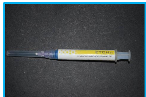
Fig. 5: Etchant

exposure to topical fluoride. In late 1980's, glass ionomer cements were proposed as an alternative to the more commonly used composite material for bracket bonding.<sup>[8]</sup> First generation glass ionomer cements had an extended early setting stage, during which the materials were highly soluble. Second generation glass ionomer had shorter initial setting time. Because of their weaker shear bond strength, the 2<sup>nd</sup> generation glass ionomer cements not advocated for direct bonding of orthodontic brackets. Recently, a light-cured resin reinforced glass ionomer, Fuji Orthod LC, was introduced as